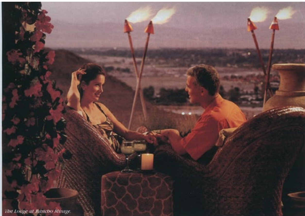
The Lodge at Rancho Mirage.

For those guests who are tethered to 2003, a business center and high-speed wireless Internet are available. A round of rousing applause is due for this hotel's uniqueness. You can't help but to feel cool when staying at The Ballantine's Hotel; like you're hanging with the "in crowd."