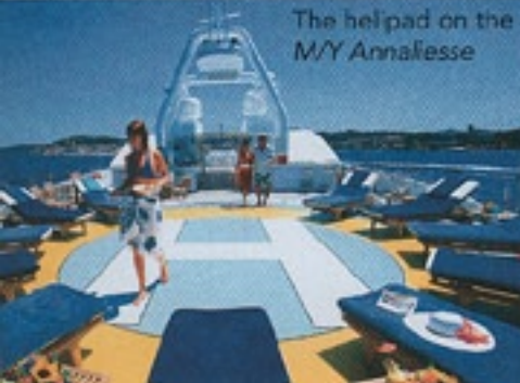
The helipad on the M/Y Annaliese