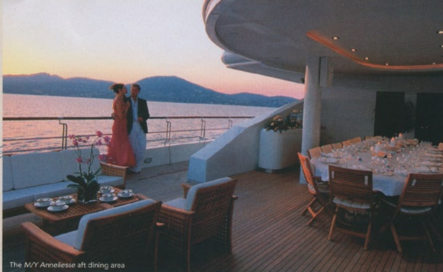
The M/Y Anneliese aft dining area

Apparently, not many dream of cruising in Mexico. When renting south of the border, passengers fly to Puerto Vallarta, La Paz or Acapulco to meet the yacht. But Mexican prices are inflated, she says, and it's not a desirable destination.