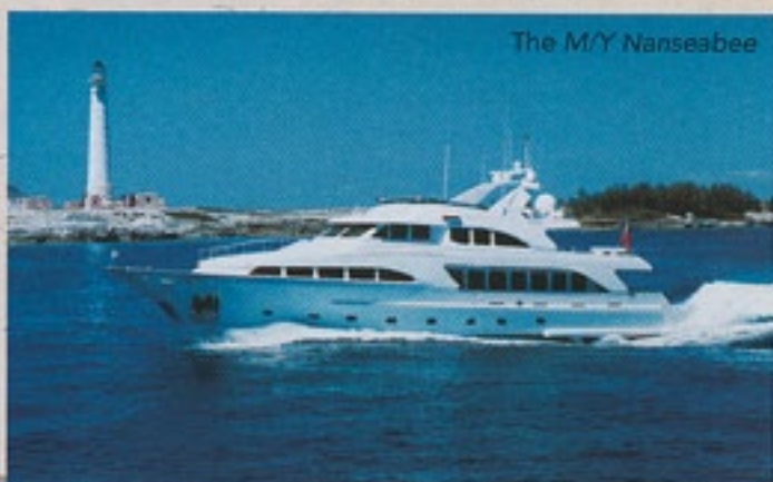
The M/Y Nanseabee

Though chartering a megayacht may be an elusive dream for some, those fortunate enough to seize the fantasy ascend to the pantheon of the American dream. ■